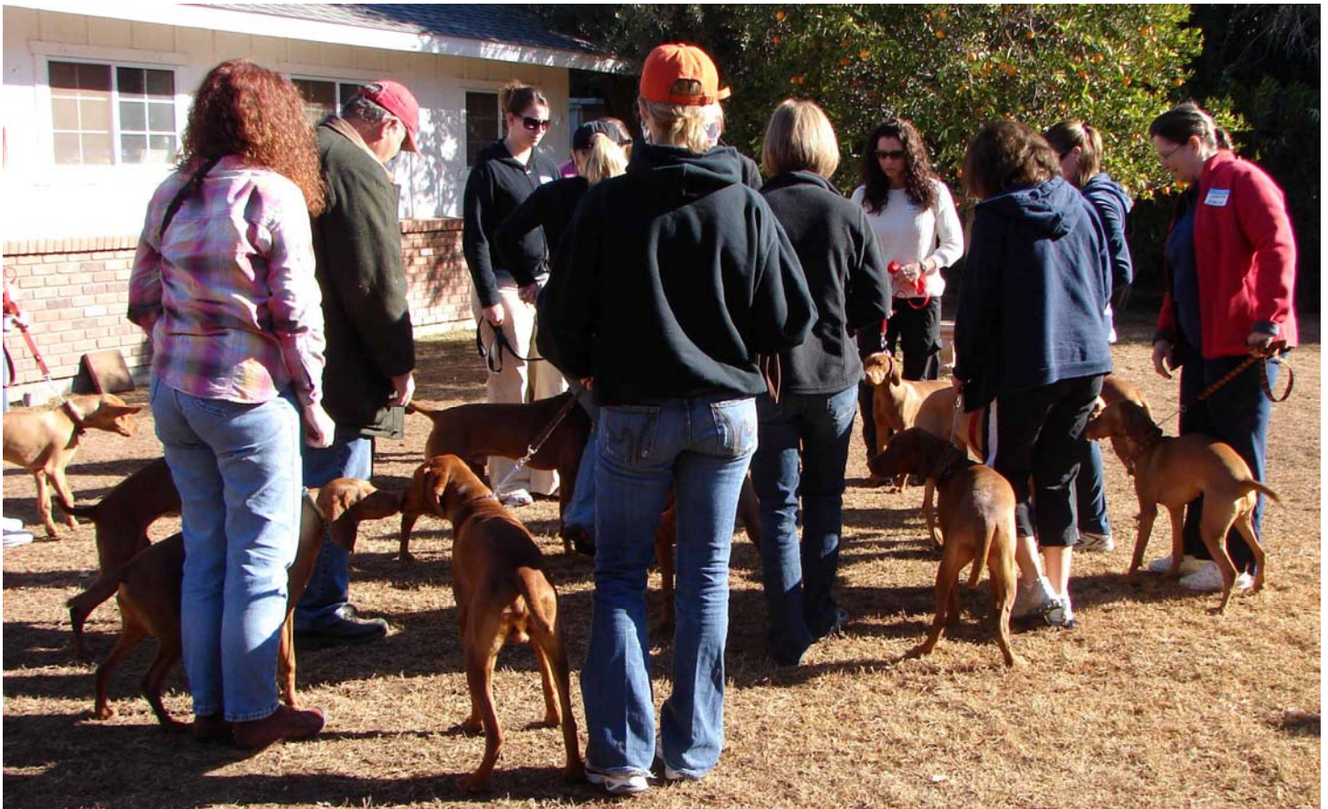
TRAINING GROUP PICTURE—COME OUT AND JOIN US AT THE NEXT SOCIALIZATION AND CGC EVENT