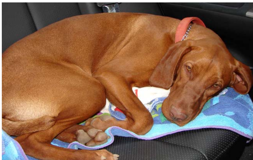
A VERY TIRING DAY!