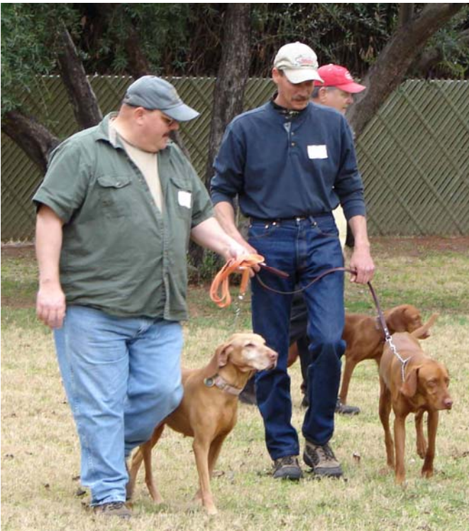
HAVANA WORKD ALL DAY AS THE FRIENDLY DOG