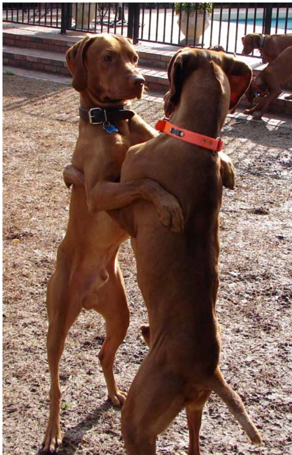
Shall we dance?

August 15 & 16, 2008 - RSVC Hunting Test - Paulden, AZ