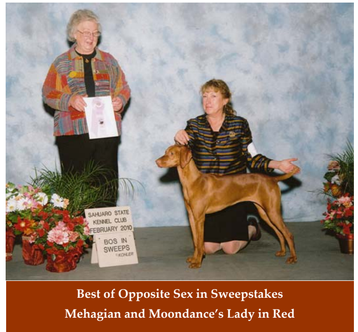
Best of Opposite Sex in Sweepstakes Mehagian and Moondance's Lady in Red