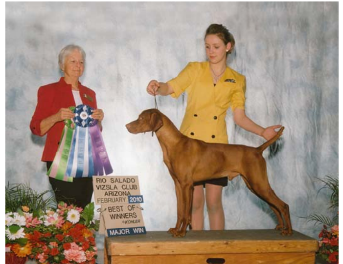
Best of Winners ~ Winner's Dog Red Diamond Renegade Dreamer