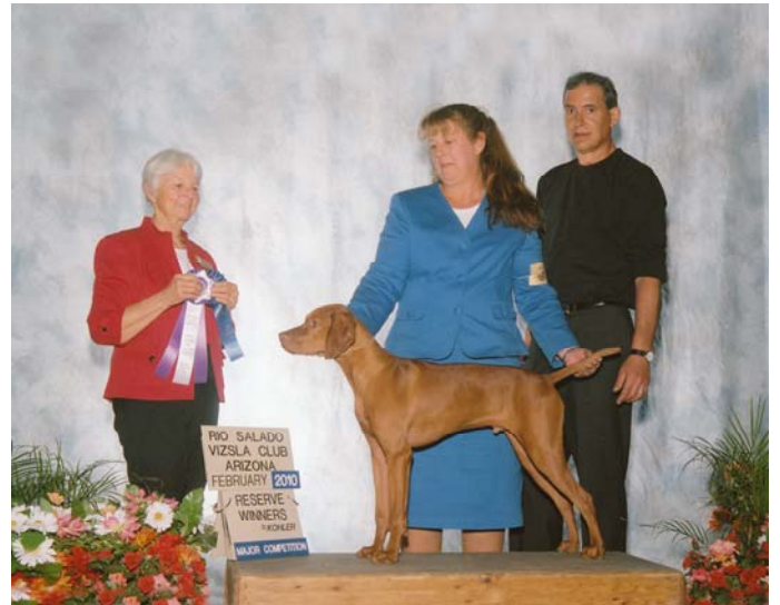
Reserve Winner's Dog Russet Leather Sirius Sequoyah