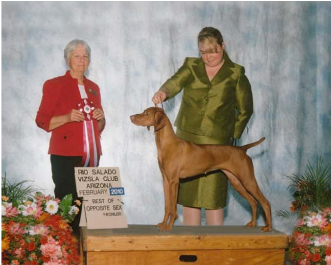
Best of Opposite Sex Ch Tivoliz NOW Pay Attention SH CD RN NA OAJ